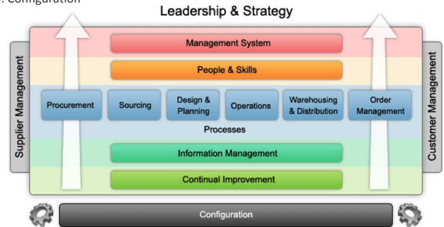
Figure 1: SCAN model

SCAN provides you with an objective assessment of how your supply chain is operating and identifies the key improvement areas.